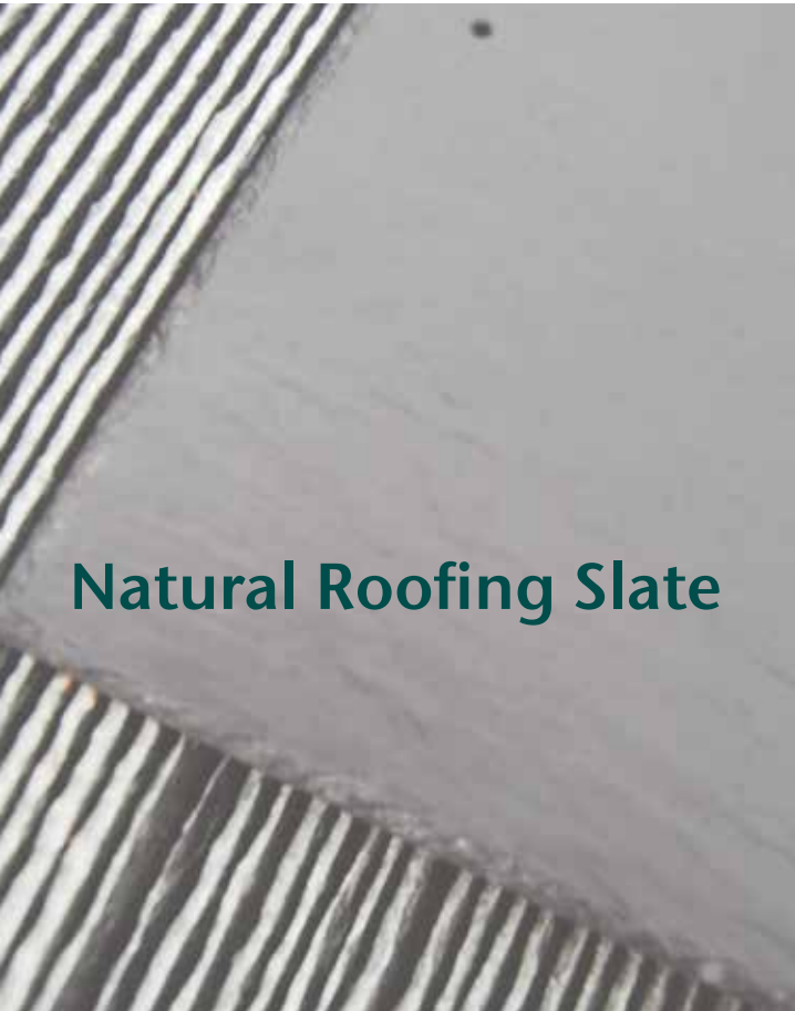
Natural Roofing Slate